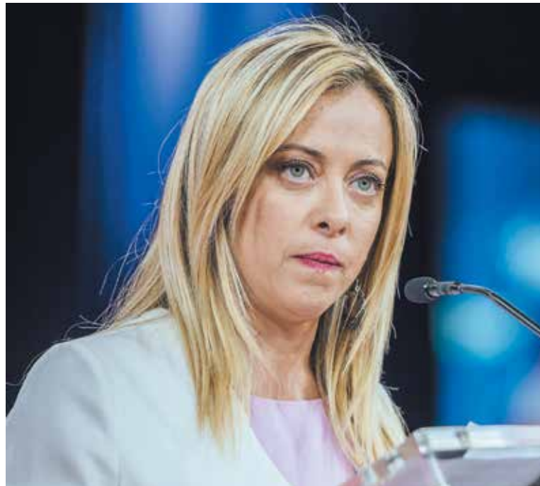
Italian Prime Minister Giorgia Meloni, pictured, rebuked Donald Trump over his attacks on Pope Leo.

Trump worsened the situation by releasing a computer-generated image of himself dressed as Jesus healing the sick. Previously, Trump had portrayed himself dressed in the white cassock of the Holy Father. These insults are further revelation of the deteriorating state of the president's mind. That such an unstable