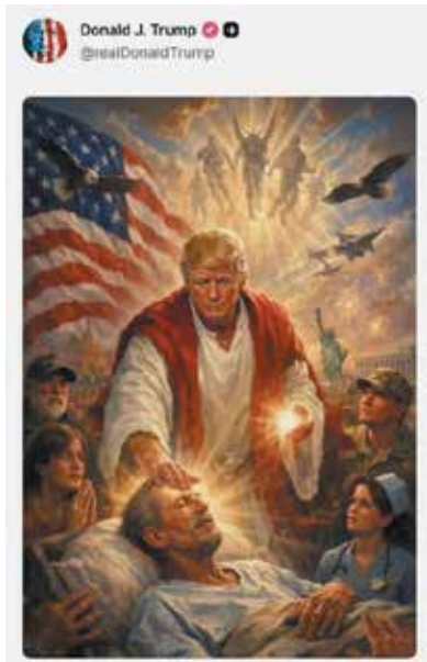
Trump depicted himself as Jesus on social media, but later said he was showing that he was a doctor healing people. The post was deleted.

Leo condemned the “atrocious conflict” in Iran, and said God rejects the prayers of those who “have blood on their hands.” When Trump threatened Iran, saying that “a whole civilization will die tonight,” Leo responded by saying the statement was “truly unacceptable.” That set off another tirade by Trump, who accused the pope of being “terrible,” and “weak on crime.” The prominent Italian