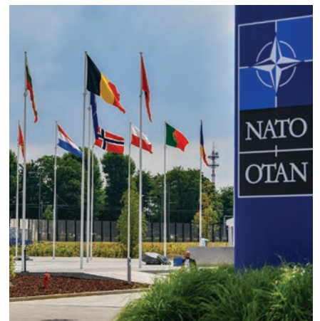
NATO headquarters in Brussels

We welcome your comments about this review here . Please give your comment a title referring to this review.